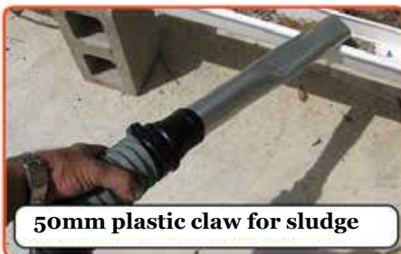
50mm plastic claw for sludge