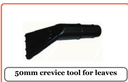
50mm crevice tool for leaves